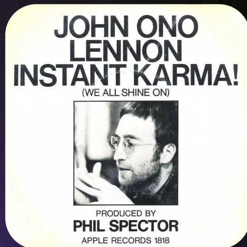
Instant Karma! John Lennon (1970)