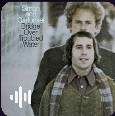
El Condor Pasa (If I Could) Simon & Garfunkel (1970)