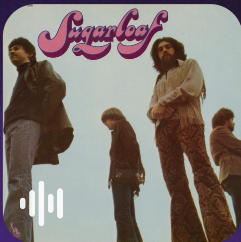
Green-Eyed Lady Sugarloaf (1970)